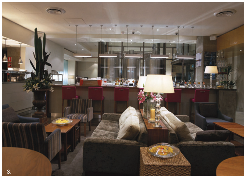
1&3. Ground floor bar 2. Level 1 lounge 4. Private dining room

Three Degrees is a new city pub at the heart of the QV development in Melbourne's CBD. The design incorporates a micro-brewery and is a destination for both workers and residents in the central city. Located over two levels, the venue enjoys a frontage to the QV central square with an upper level terrace overlooking the activity below. The pub also caters for dining, either through a series of informal spaces or through private rooms suited to corporate occasions.