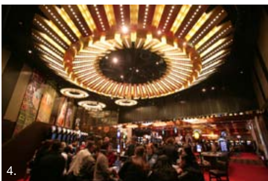
1. North Entry 2-4. Gaming Floor