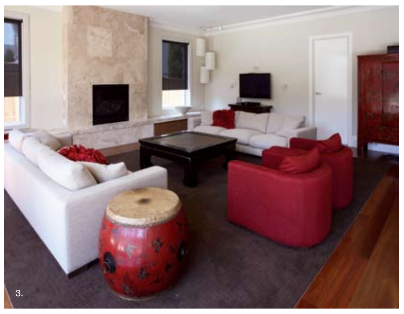
1. CHILD'S BEDROOM 2. SITTING ROOM 3. INFORMAL LIVING 4. KITCHEN