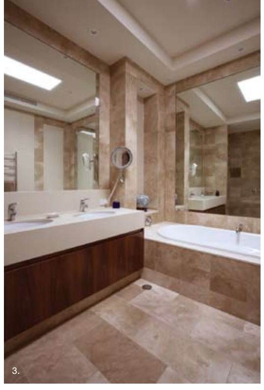
1. KITCHEN DINING 2. ENTRY HALL 3. MASTER ENSUITE